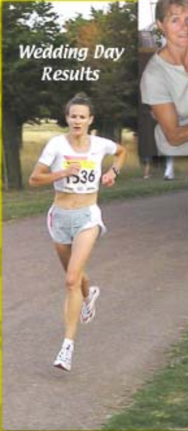
Wedding Day Results