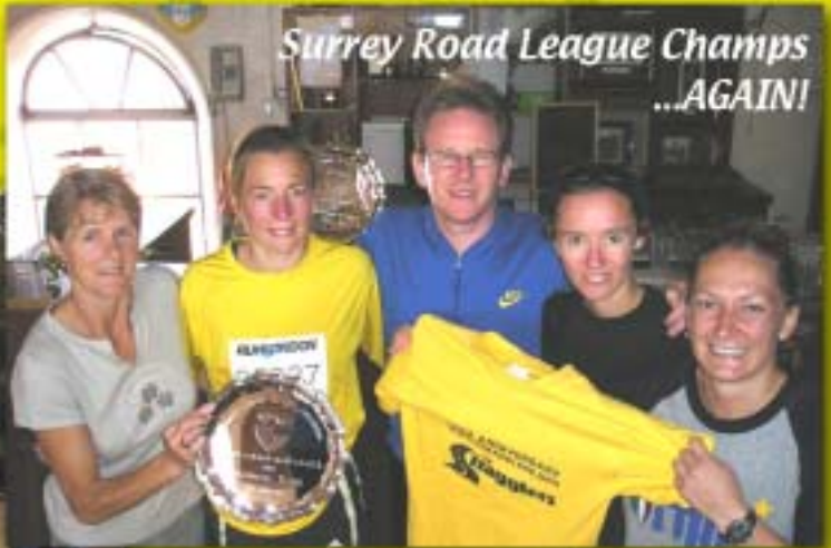
Surrey Road League Champs ...AGAIN!